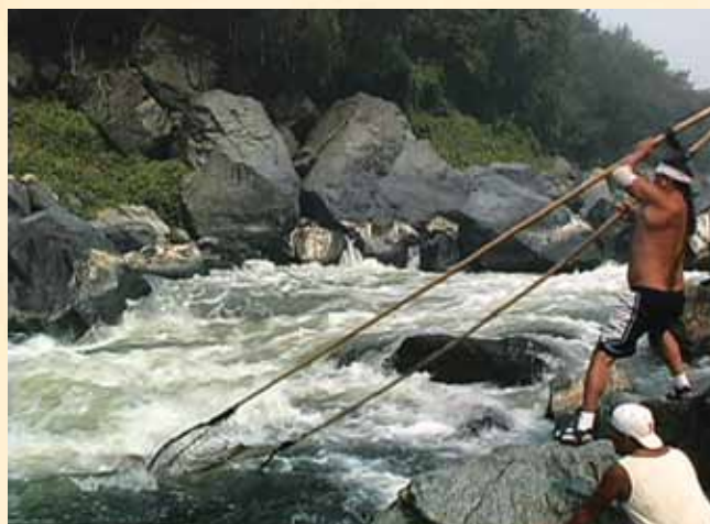
River of Renewal