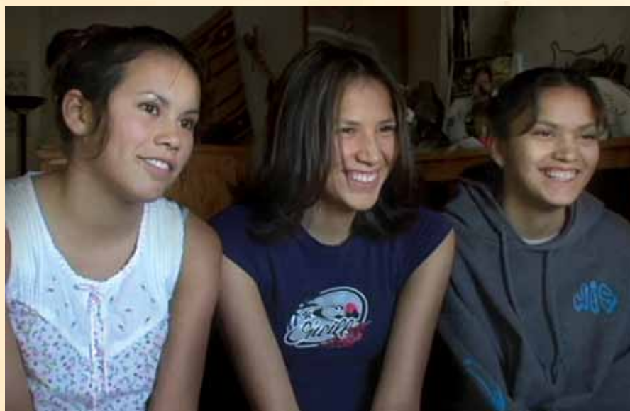
Video Letters from Prison