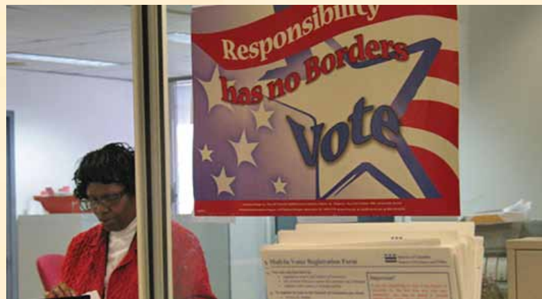
Diversity Beat .