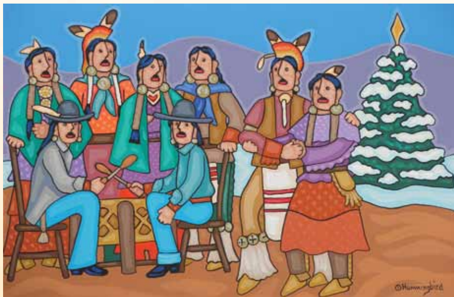
The Twelve Days of Native Christmas