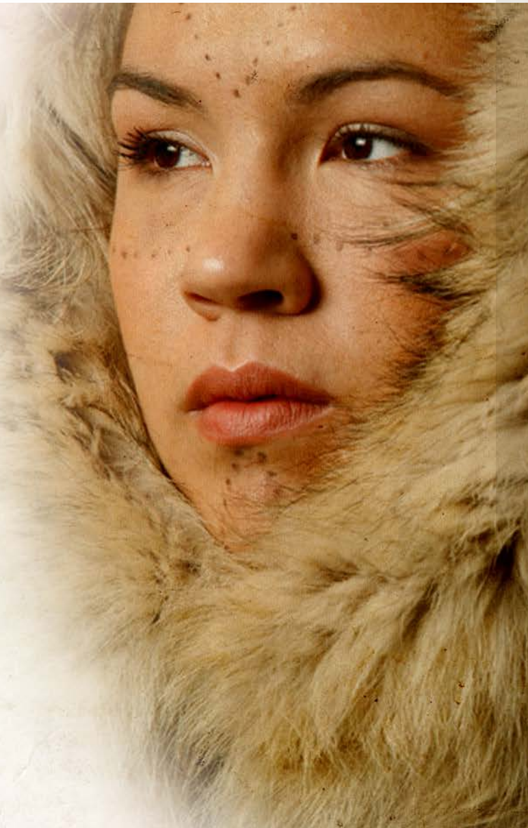
Image from Games of the North: Playing for Survival .

GRAB is about three families from the Laguna Pueblo Tribe who prepare for Grab Day—where they throw groceries from a rooftop to the community waiting below them. Grab Day is an annual community-wide prayer of abundance, thanks and renewal.