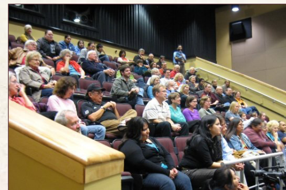
Scenes from the third biennial VisionMaker Film Festival.